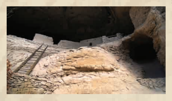
Gila Cliff Dwellings National Monument, New Mexico

highlands that had sustained them for the previous millennium. They settled on valley floors near arable land and eventually developed extensive irrigation features as their dependence upon maize agriculture increased. As it had with other prehistoric Southwestern cultures, the "Great Drought" in the late A.D. 1200s accelerated abandonment and forced aggregation: both in independent Mogollon culture enclaves and in residential complexes that appear to reflect a mixture of cultural remnants from both the Anasazi and Hohokam.