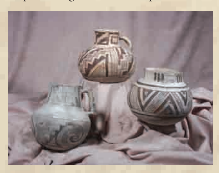
Examples of Anasazi pieces

The Colorado Plateau, located in the four corners region where the borders of New Mexico, Arizona, Utah, and Colorado meet, is the Anasazi core area. The generally accepted chronological framework for the Anasazi includes three Basketmaker and five Pueblo stages spanning a period from approximately A.D. 1 to some time in the 1300s. This chronology was first proposed and then refined by A.V. Kidder and other archaeologists at the 1927 Pecos Conference. The Pecos Classification still applies over much of the Anasazi area but has been discontinued in favor of local phase designations in some places.