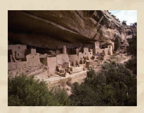
Cliff Palace at Mesa Verde National Monument

Province. The Hohokam core area was in the drainage basin of the Gila and Salt Rivers, centered around the modern city of Phoenix, in the southern Arizona desert. The Gila and Salt Rivers were the lifelines of Hohokam culture because they provided the Hohokam with water for hundreds of miles of irrigation ditches. Modern canals, known today as the Salt River Project near Phoenix, closely follow and/or incorporate the original Hohokam irrigation ditch systems. Secondary and ephemeral drainage tributaries of the Gila and Salt Rivers also supported settled groups, with variations, on the Hohokam agriculturalist theme.