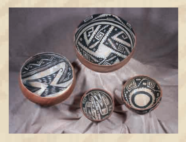
Examples of Roosevelt Polychrome or Red Ware

One of the distinctive ways of ascribing cultural identity is to examine burial or funerary practices. Most Anasazi buried their dead in a flexed position, knees drawn up to the chin, in trash mounds, abandoned storage pits, and under room floors. The Mogollon buried their dead in a supine, extended position under room floors. The Hohokam cremated their dead and buried the ashes, often within ceramic vessels. The Salado ini-