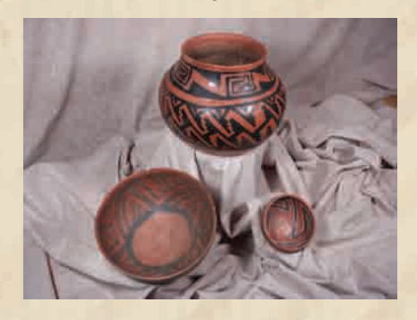
Maverick Mountain Vessels

ic technology and movement from scattered villages to concentrated pueblo dwellings. By A.D. 1200, Anasazi influence was widespread in the Southwest, and both the Hohokam and Mogollon cultures show an increased adoption of Anasazi traits. Some Kayenta and Tusayan groups began migrating from the four corners area about A.D. 1265, probably due to significant environmental and social stresses on the population. The Colorado Plateau was virtually abandoned by the end of the 13th century, and there is increasing evidence to suggest that the Anasazi migrated south into areas previously occupied only by the Hohokam and Mogollon.