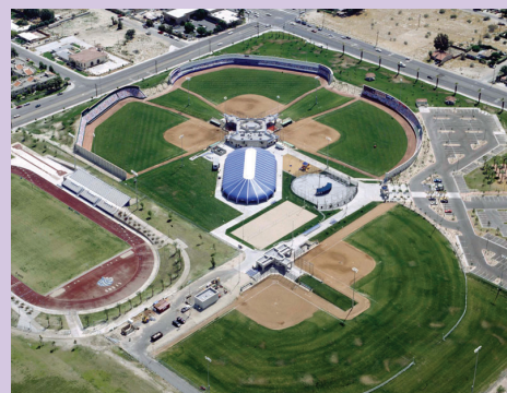
Big League Dreams complex in Cathedral City, California