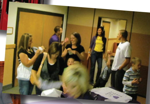
Attendees gather for two days worth of activities and events!