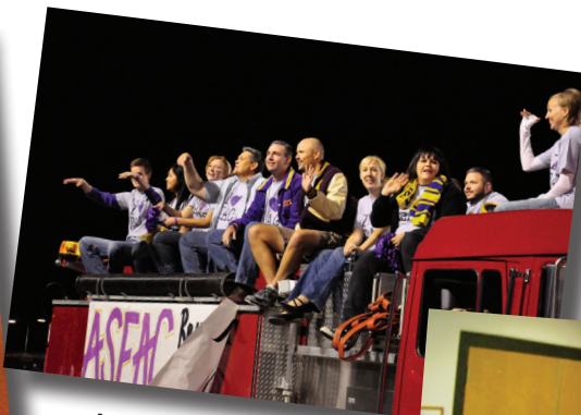
ASEAC reunion attendees ride a firetruck at half-time.