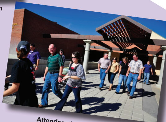
Attendees take a tour to see how campus has changed.