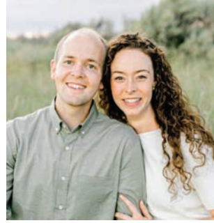
Larson & Allen