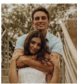
Von-Hack Prestinary & Judd