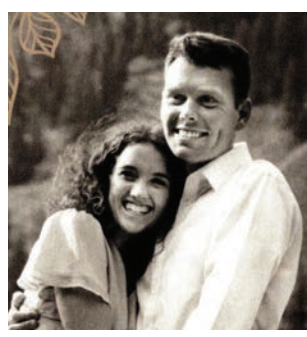
Pearce & Higginbotham