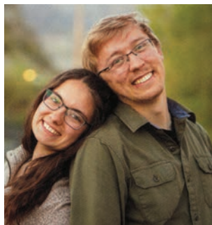
Adams & Lush