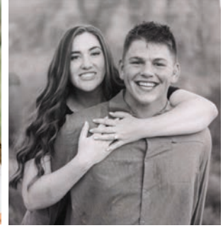
Ellett & Kirkland