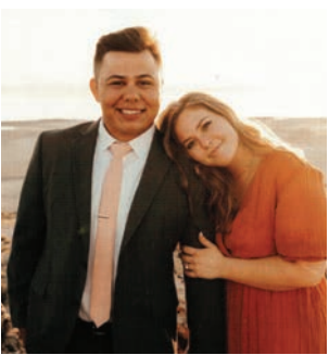
Wilhelm & Finch