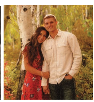
McMaster & Shumway