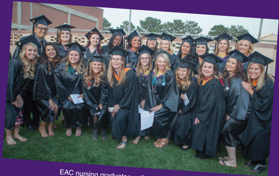
EAC nursing graduates gather for a photo prior to the 2016 EAC Commencement ceremony.

Follow us on Facebook facebook.com/gilamonsters