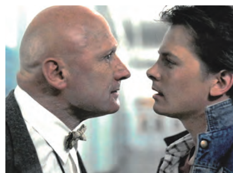
“Back to the Future II”