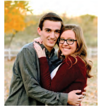
Chatwin & Pearce