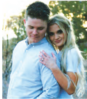
Price & Black