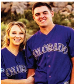
Peck & Scarlett