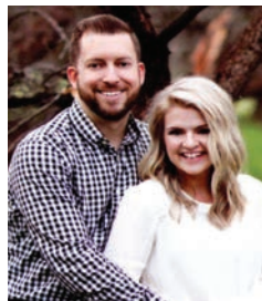
Sorensen & Hitlock