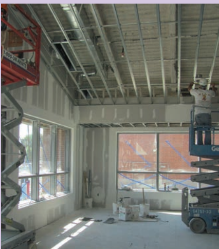
While work has largely been completed on the outside, workers are busy finishing up the interior.