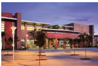
Shadow Hills High School