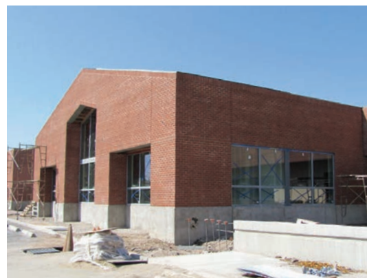
The exterior of the new Alumni Visitor Center will match the facade of the existing Gerald L. Hoopes Jr. Activities Center.

The building will be completed by the end of the Fall 2012 semester. A formal dedication of the visitors center will be part of the 125 th Anniversary celebration and reunion that will be held next year. Make plans to attend this fantastic all-school reunion and take a tour of the new Alumni Visitor Center during Homecoming weekend 2013.