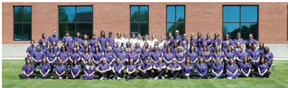
Group photo taken April 2012 of all four blocks of EAC nursing students on the front lawn of the College's new Nursing Education Center.

Donations can be made by check or credit card using the enclosed pledge envelope. You may also choose to donate on our website at www.eac.edu/alumni/giving , or by phone at (800) 445-2472. Nursing Program. Our graduates are received well in the work force and are taught to give