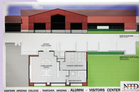
The building's interior will house a reception area, storage room and work space, and offices for the Foundation staff.