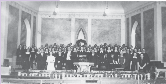
The community choir readies for the Dec. 1941 performance of Handel's Messiah in the old LDS church across the street from the College.

The community was invited to make Messiah part of their Christmas tradition. Messiah was performed as a gift to the Gila Valley without charge. Those in attendance to this packed house were treated to a wonderful evening of Christmas tradition and fantastic talent.