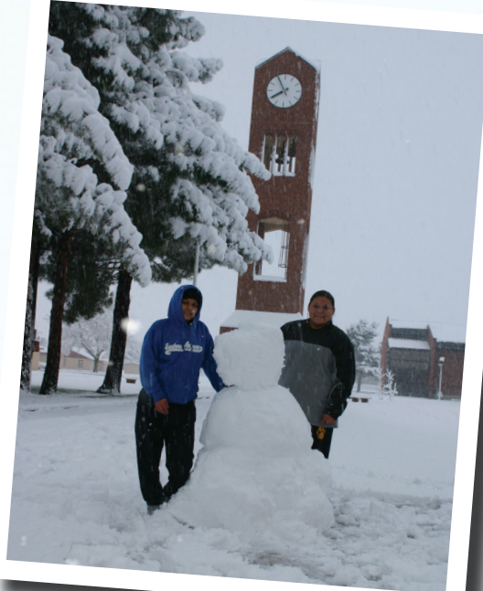
Two students build a snowman on Eastern Middle Campus during a snowstorm in 2007.