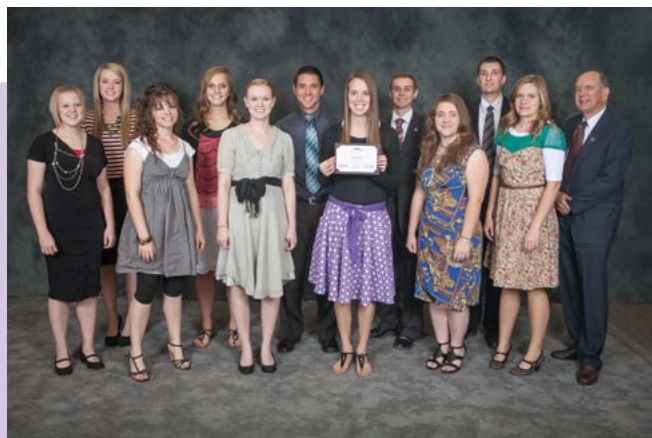
Recipients of the 2013 Alumni Association Scholarship pose for a photo immediately following the 29 th Annual Scholarship Banquet held on October 18, 2013, at the College's Gerald L. Hoopes Jr. Activities Center. For a list of recipients of the 2013-2014 Donor Scholarships, please see page 9.

P. O. Box 769 Thatcher, AZ 85552-0769 or by e-mail at: alumni@eac.edu