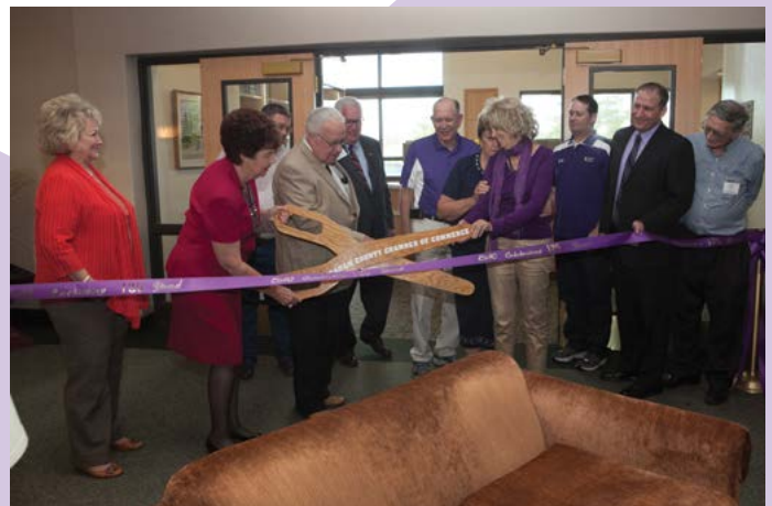
College and Alumni Association officials cut the ribbon after the dedication and opening of the College's new Alumni-Visitors Center.