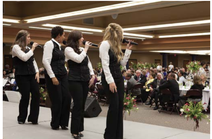
The women of EAC's Fourté wowed the crowd with their rendition of Boogie Woogie Bugle Boy of Company B .