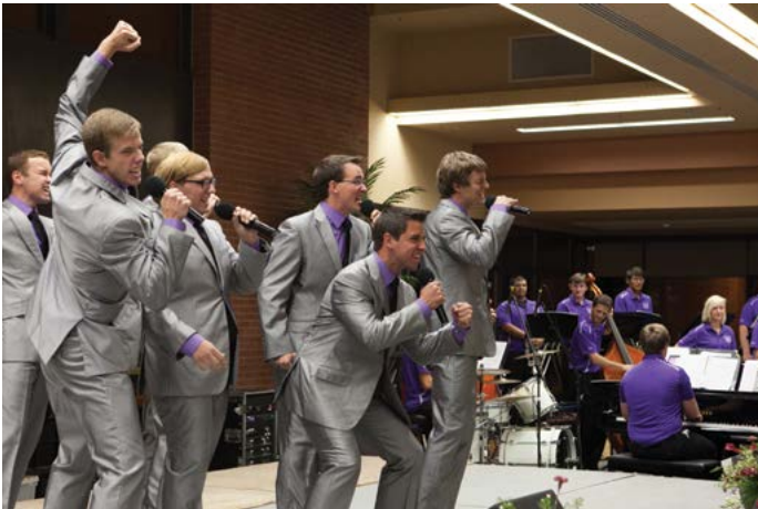
EAC's GuyZ performing at the 125 th Anniversary Banquet.